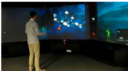
Figure 2. Interacting with the system in the VisionSpace.

MolyPoly is a 3D molecular chemistry teaching simulation with a gestural interface. Based on the original system called MolyMod developed by 3 rd -year HIT Lab AU students, MolyPoly was developed to evaluate the effectiveness of a system that enables viewing of a structure from different angles, compared with traditional chemistry teaching methods. The setup consists of a Kinect Camera (positioned directly in front of the user) and Vision Space (3 large screen stereoscopic projection system), as illustrated in Figure 2.